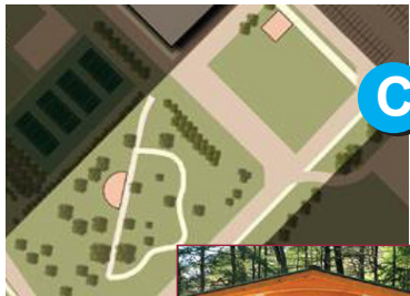
C OUTDOOR CLASSROOM Utilize outdoor spaces for learning