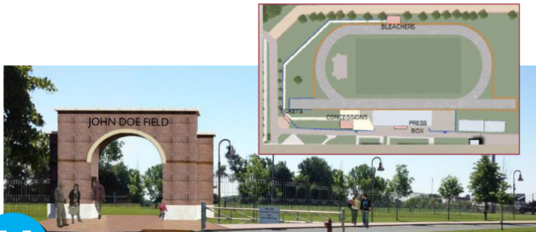
H FIELD IMPROVEMENTS