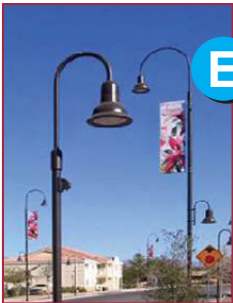
E SITE LIGHTING Safety, efficiency, aesthetics

Exercise/Athletic facilities and equipment for community members and students