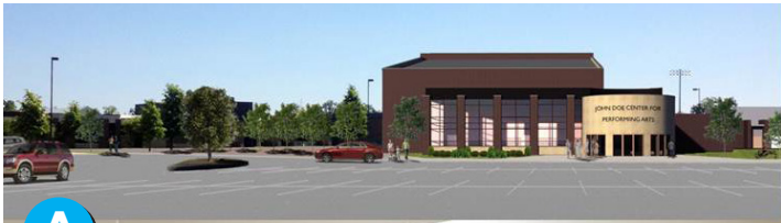
A AUDITORIUM ADDITION For performance arts, including school and community sponsored events