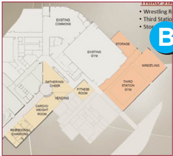
B FITNESS CENTER / THIRD STATION GYM ADDITION

Exercise/Athletic facilities and equipment for community members and students